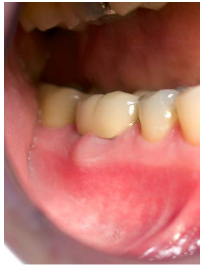
Figure 4: A gingival abscess

In general, members of SAG have a propensity to form abscesses and cause invasive pyogenic infection, including head and neck infection, brain abscesses, intra-thoracic and intra-abdominal infections. Predisposing or underlying conditions noted with infection by SAG include previous surgery, trauma, diabetes, immunodeficiency, and malignancy, but may also be related to hygiene or the patient's overall general health condition as outlined above.