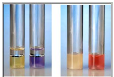
Figure 5: Hardy's Rapid Anginosis ID Kit performs an arginine decarboxylase (positive seen in the second tube) and a Voges-Proskauer test (positive seen in the fourth tube) to quickly place a strep within the anginosus group.

In conclusion, members of SAG have a tendency to cause abscess formation, but different species have a different propensity for pyogenic infection. Therefore, since the three species of SAG are associated with different clinical manifestations and symptoms, it is useful to identify these microorganisms in order to further investigate the etiology of disease and optimize patient outcomes.