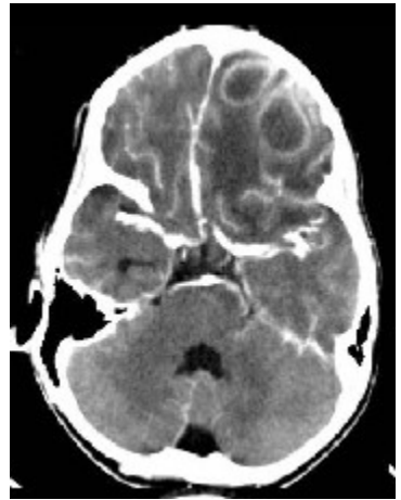
Figure 3: A CT scan of a SAG brain abscess from an 8 year old presenting with fever and headache for one month.

Head and neck infection by SAG is generally associated with dental origin and the majority of these patients usually require surgical intervention. Consequently, odontogenic infection cannot be ruled out in patients with SAG bacteremia of unknown source, especially in patients with poor dental hygiene.