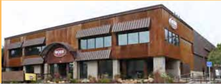
The Moxie Cafe, Santa Maria, California

To further the company's healthy lifestyle philosophy, the Moxie Cafe was opened in the Spring of 2014 in Santa Maria to offer a multitude of healthful yet delicious selections.