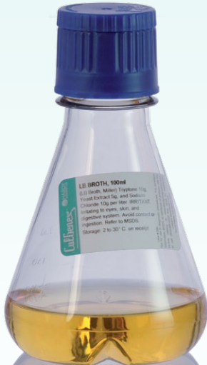
250ml polycarbonate shaker flask