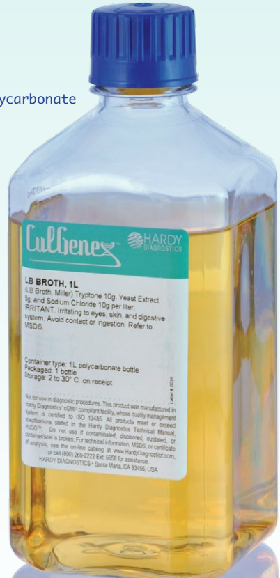
1L polycarbonate bottle